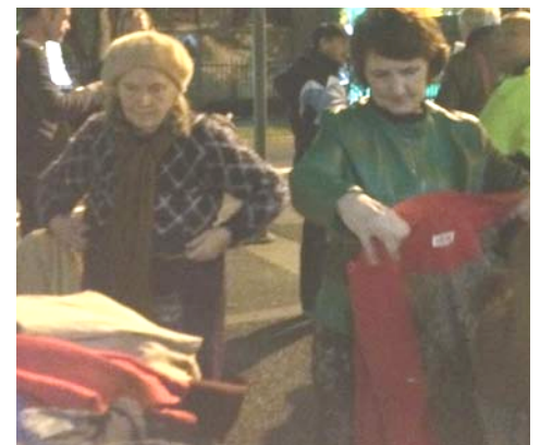
Parishioners sorting the donated jackets