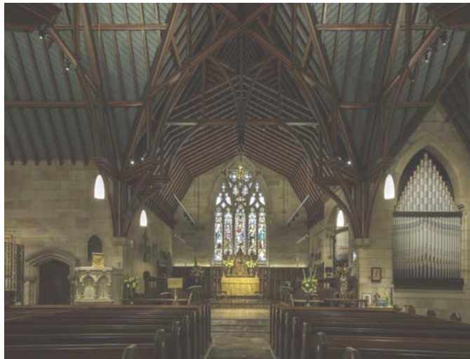
St Paul's east end interior, showing blue ceiling

The church is sympathetically lit, removing the deep shadows and the blinding glare. A soft warm light now fills the church, highlighting the altar, the pulpit and the lecterns. There are eight different computer balanced lighting combinations set for different services and occasions. All compliment beautifully Blackett's (the original architect) design