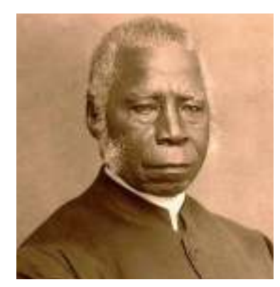
The Right Reverend Samuel Ajayi Crowther

Nigeria during the latter part of the 19th Century.